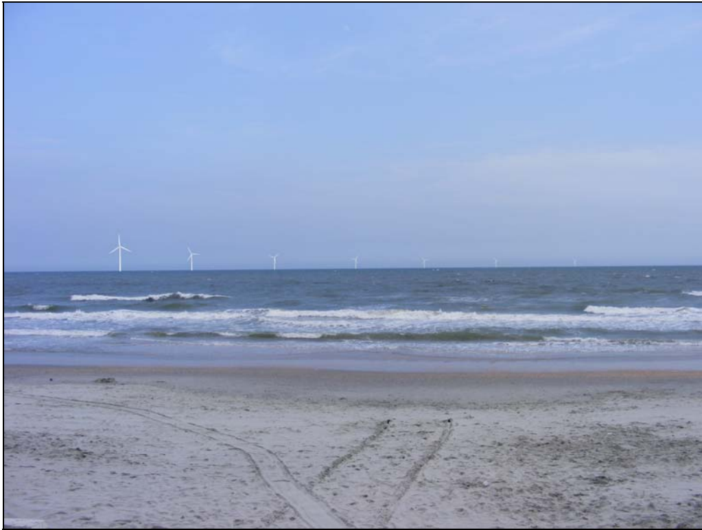
Figure 1: This photo simulation published by Santee Cooper in November 2009 compares the visibility of wind turbines placed at varying distances from shore. Specifically, the turbines are depicted at distances, left to right, of 2 miles, 3 miles, 4 miles, 5 miles, 6 miles, 7 miles and 8 miles from the shore. Different light, wind and haze conditions could make them more or less visible.

South Carolina Act 318 of 2008 created the Wind Energy Production Farms Feasibility Study Committee to review, study, and make recommendations regarding the feasibility of wind farms in the state including, but not limited to, whether South Carolina is a suitable site for wind production on land or in offshore areas, the economic and environmental impact to the state, and the cost of wind farm installation and operation in the state.